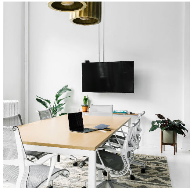
Natural light pours into a pair of Meeting Spaces, each outfitted with Layout Studio Tables and Setu Chairs, making them ideal for design reviews, when teams need to make decisions about colors and materials.