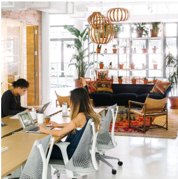
Soludos worked with Homepolish to integrate vintage pieces into the mix of Herman Miller furniture used to outfit the space, creating settings such as this Cove (background), which has the look and feel of a Montauk beach house living room.

At the outset, Herman Miller helped Soludos reevaluate how space might be optimized to both express the brand and support its people, as Brown says, "really trying to understand the challenges with the way that we used to work, and building a roadmap to efficiency within the office and organizational framework." The first step was to understand the needs of each employee and the activities of the various teams. Then, Herman Miller worked with Soludos on creating a purposeful variety of settings that could address those needs and activities—a main working area or Hive, formal Meeting Spaces, and additional settings for more informal gatherings. Simultaneously, the adjacencies of these settings were planned to promote productive and efficient connections that could support the growth of the company.