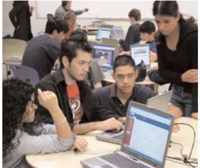
Ralph Campbell © 2005 Estrella Mountain Community College