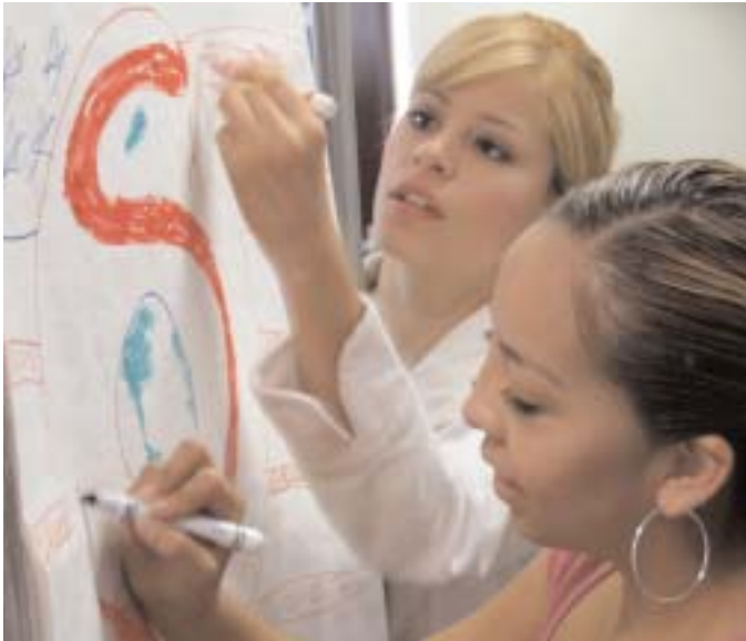
Andrew Nolte © 2005 Estrella Mountain Community College